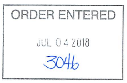
The Honourable Justice Raikes